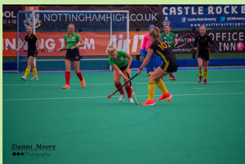
Ladies 1s v Beeston winning 5-1 in their first league match