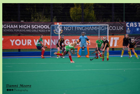
M2s v Mansfield